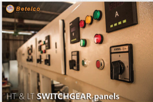
HT & LT SWITCHGEAR panels